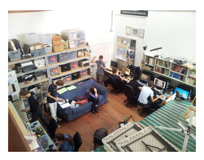
Figure 3.1: <a href="http://webcam.ucc.asn.au">http://webcam.ucc.asn.au</a>

We don't have cleaners, so look after the clubroom! There is always a door group member in the room, and one of the things they do is help with the big clean ups were the whole room gets turned inside out and upside down, so if they ask you to clean something up, it is a good idea to do so. Of course you don't need to be asked, so if you see something that needs doing, feel free to do it!