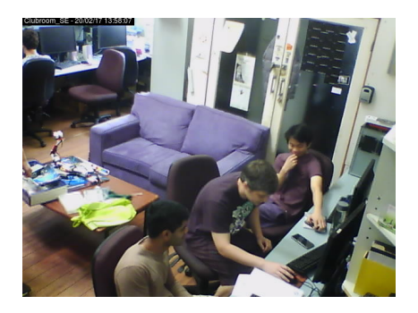
Figure 4.1: < https://webcam.ucc.asn.au>

We don't have cleaners, so we rely on our members to look after the clubroom. There is always a door member in the room if it's open. Of course, if you see something that needs doing such as cleaning up, feel free to do it!