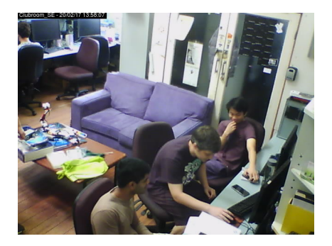
Figure 3.1: <a href="https://webcam.ucc.asn.au">https://webcam.ucc.asn.au</a>

We don't have cleaners, so we rely on our members to look after the clubroom. There is always a door-holder in the room if it's open. Of course, if you see something that needs doing such as cleaning up, feel free to do it!